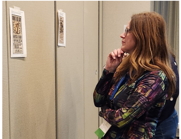
Educators at the National Council for History Education conference consider materials from one of The ILC's Teaching Immigration Series resources: Immigration and the Civil War .

Did you know that during the Great Depression two million people of Mexican ancestry were forcibly relocated to Mexico, including approximately 1.2 million U.S.-born citizens? This is one of the aspects of the Great Depression that middle and high school students will learn about in the latest addition to The ILC's Teaching U.S. Immigration Series. These lesson plans on Immigration and the Great Depression are made available for free to educators on The Immigrant Learning Center's website and on the popular ShareMyLesson platform from the American Federation of Teachers.